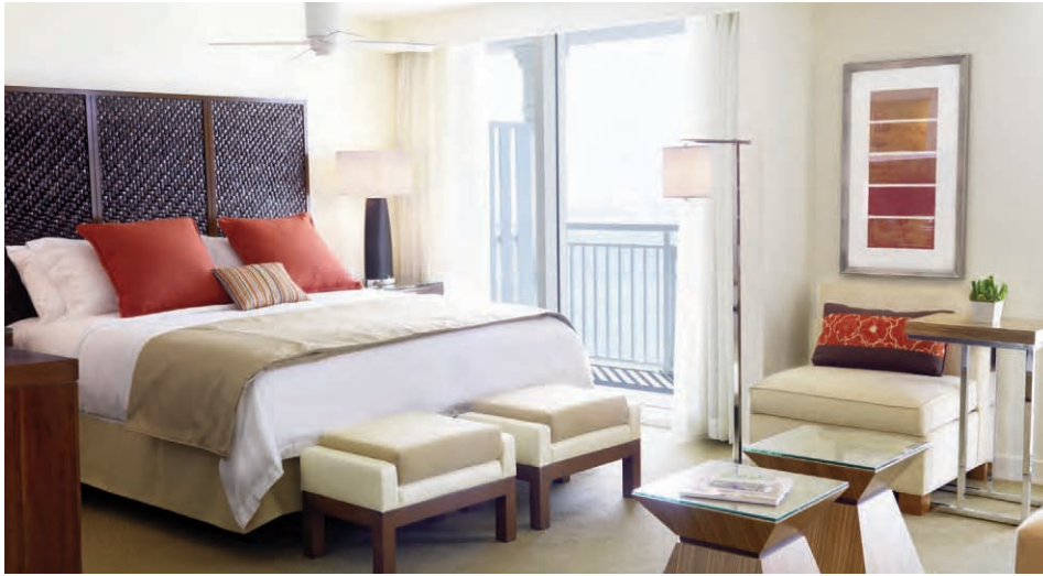
The Reach Resort's Caribbean-style guest rooms offer a relaxing and intimate getaway.

control for guests and increasing energy efficiency; a necessary element in modern building design and renovation. This change necessitated a design-build approach managed by the general contractor in order to incorporate the ductwork with the catwalks and guest rooms. In addition to the comfort, control and energy efficiency benefits of a new fan coil system, exterior noise was eliminated in the pool courtyard area.