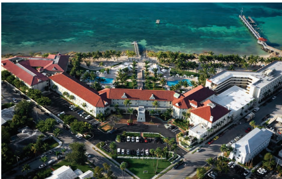
An aerial shot of the historic Casa Marina Resort & Beach Club, featuring more than 1,000 feet of Key West's southern shoreline.

The result of this effort is the world-class revitalization of an iconic property. The Casa Marina Resort & Beach Club is both classic and contemporary, capturing the allure and timelessness of his-