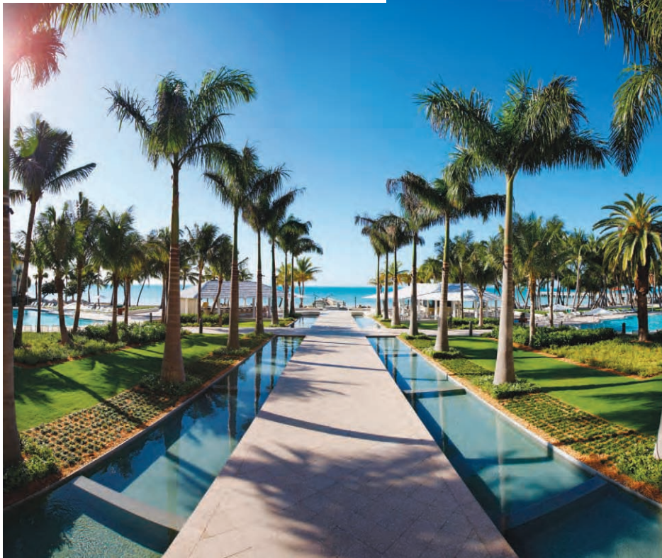
The water walk reflecting pools create an avenue to the largest private beach in Key West at Casa Marina.