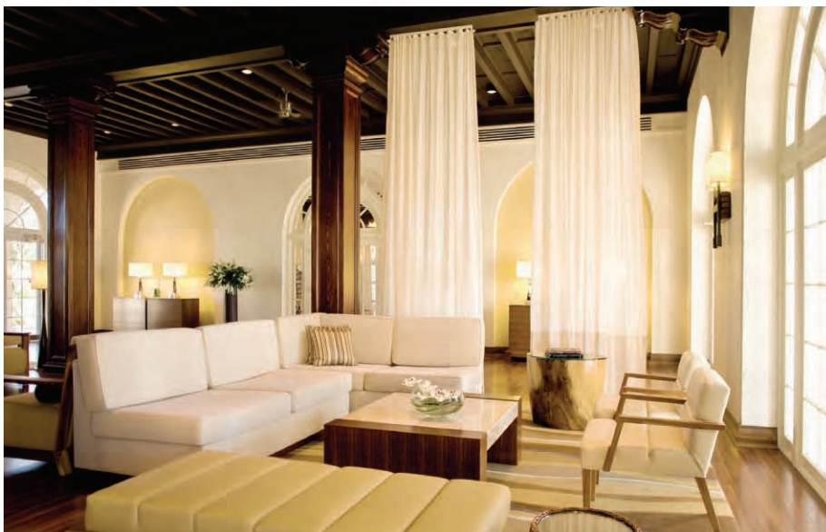
The lobby of the Casa Marina has been finished and fully restored to traditional and timeless Key West style.

toric Key West while benefiting from the most modern furnishings and materials.