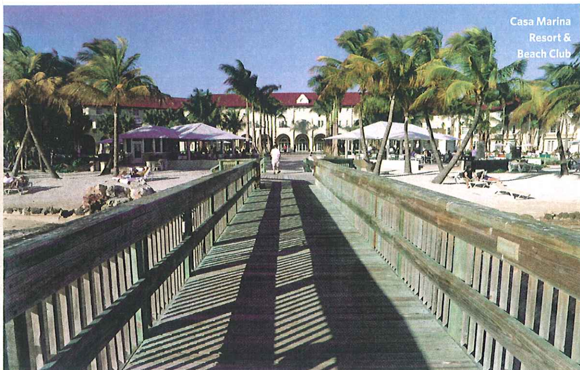
Casa Marina Resort & Beach Club

Zou Zou Boutique's trendy dresses (zouzouboutique.com) and Siegel's fashions (siegelsonline.com) are among the best for local shopping. — KLS